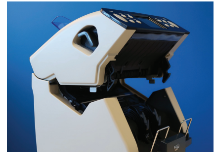
Pull the handle to open the top. Easy access for cleaning and maintenance.