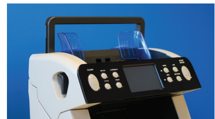
Integrated carrying handle.